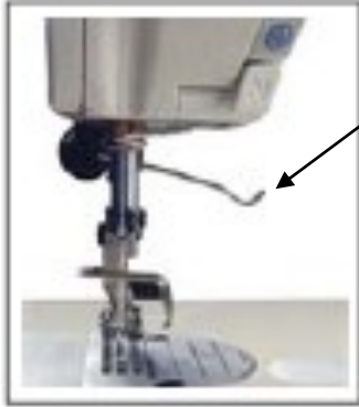
Conventional type wiper

Clip Device - which is a new generation of thread wiper, to avoid the bird-nest during backstitching, and threading